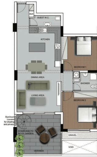
APART. 403-4th FLOOR