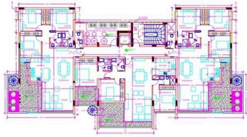
ΚΑΤΩΦΗ 3ου ΟΡΟΦΟΥ