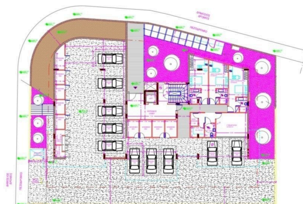
KATOWH 5ou OPOBOY