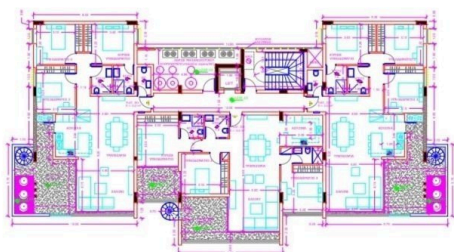
KATOWH 3ou OPOBOY