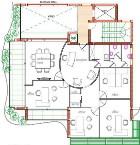
Furniture Layout Scale 1:100