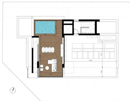
Roof Garden Plan