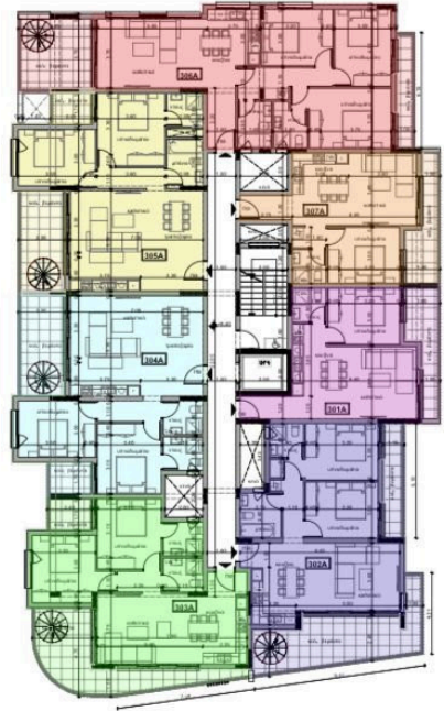
ΚΑΤΩΦΗ 3ου ΟΡΟΦΟΥ / BLOCK A 1:100