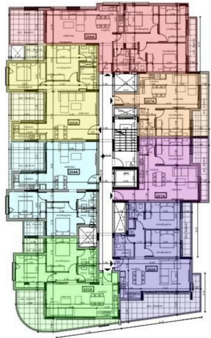
KATOVIH 2-oi OPOROV / BLOCK A 1:100