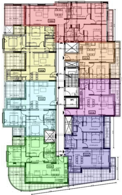
KATOPIH 1-ov OPOBOY / BLOCK A 1:100