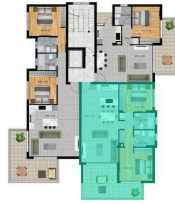
FLAT 102, 202, 302, 402+ 502

Internal Area # 82.00 SQM Covered Veranda # 20.50 SQM