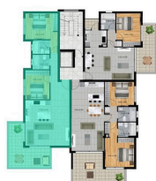
FLAT 101, 201, 301, 401+ 501

Internal Area # 81.50 SQM Covered Veranda # 20.50 SQM