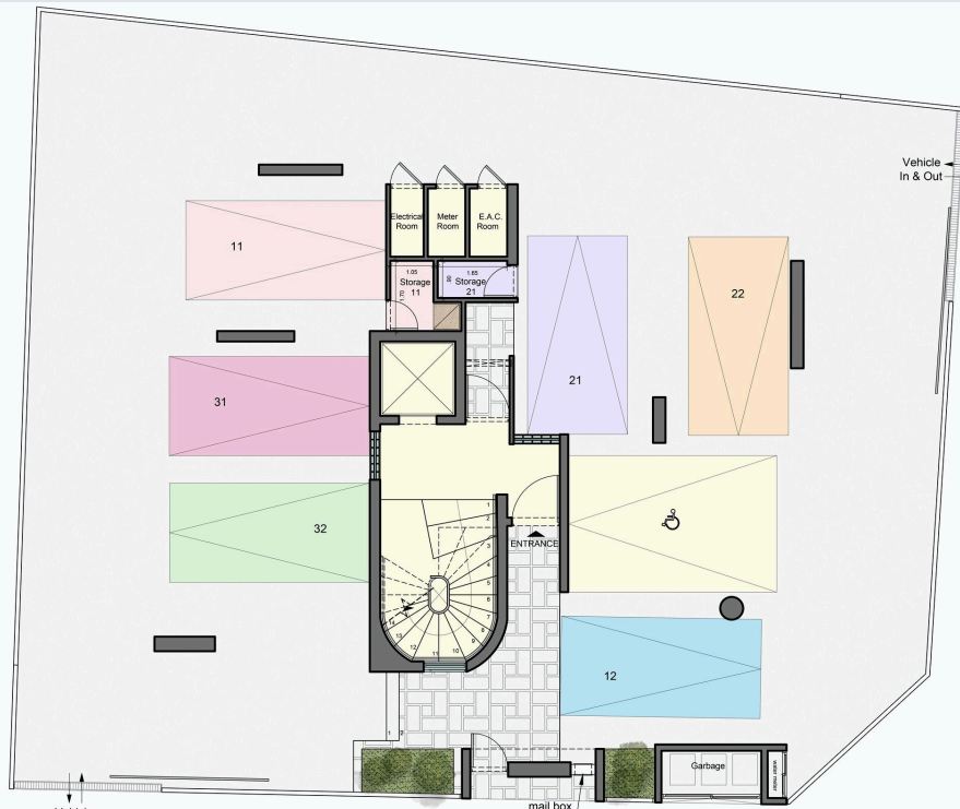
GROUND FLOOR LAYOUT