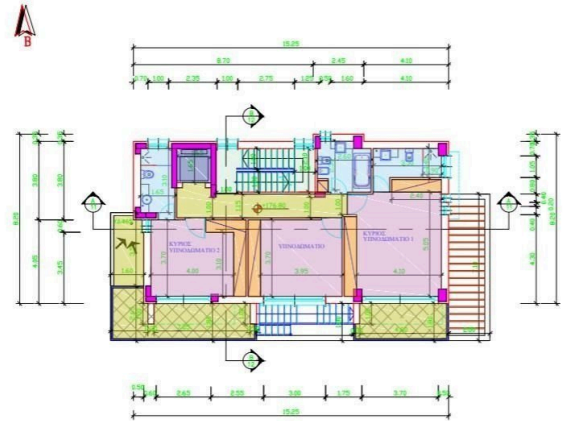
ΚΑΤΩΦΗ ΟΡΟΦΟΥ ΚΛΙΜΑΚΑ 1:100