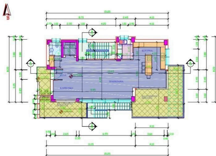
ΚΑΤΟΨΗ ΙΣΟΓΕΙΟΥ ΚΛΙΜΑΚΑ 1:100