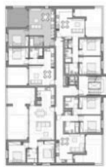
2nd floor plan