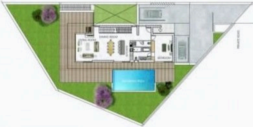
4 BEDROOM VILLA