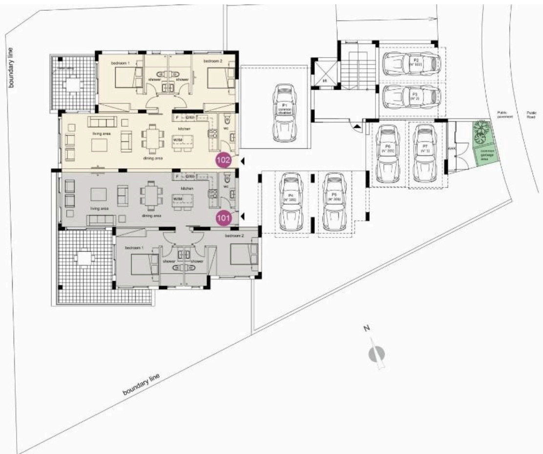
GROUND FLOOR LEVEL 2