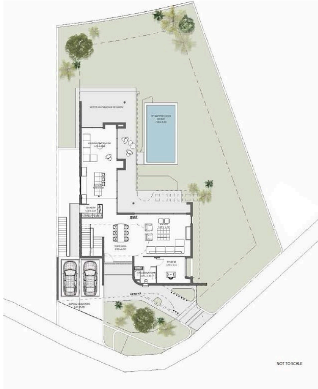
FLOOR PLANS - FIRST FLOOR