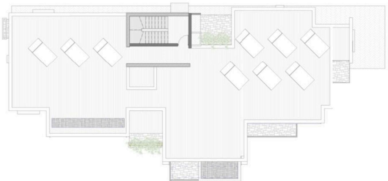
005 Roof Plan 1 : 100