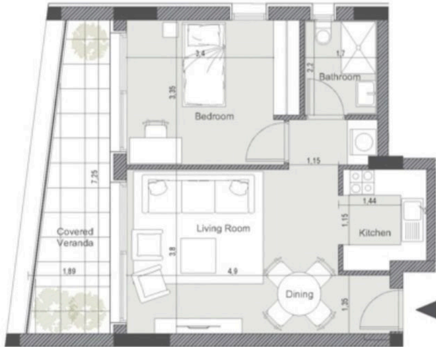
5th FLOOR APT 502