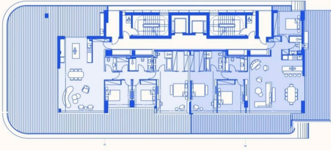
APARTMENTS Level 12