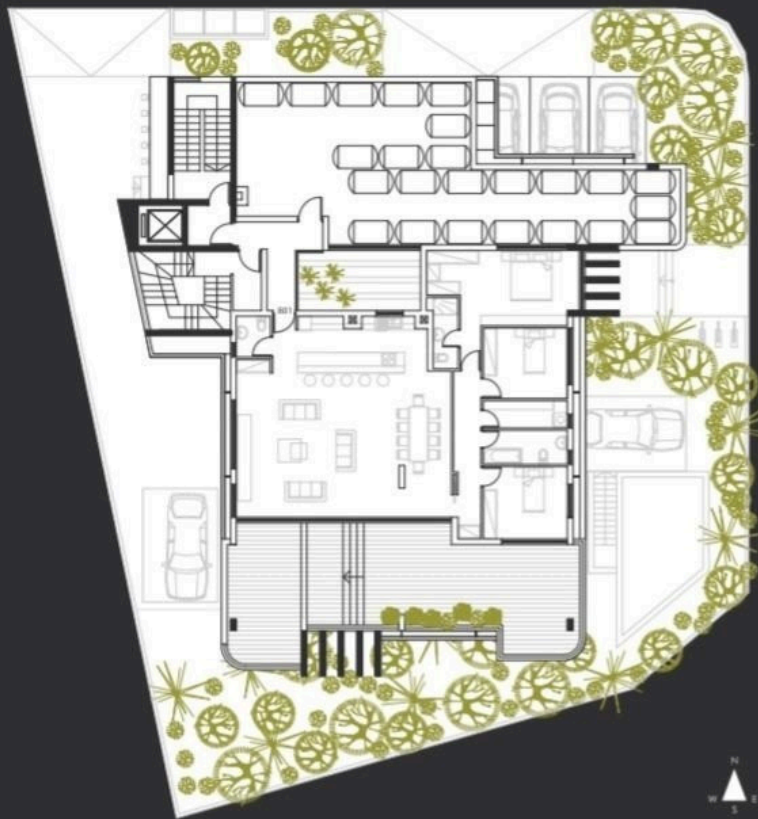
8 TH FLOOR