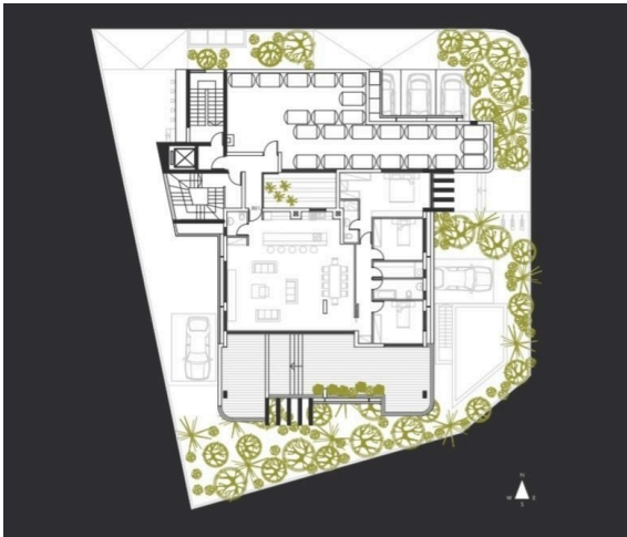
8 TH FLOOR