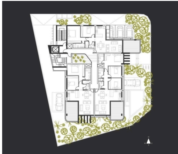
7 TH FLOOR