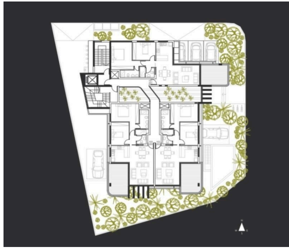
1 st - 2 nd FLOOR