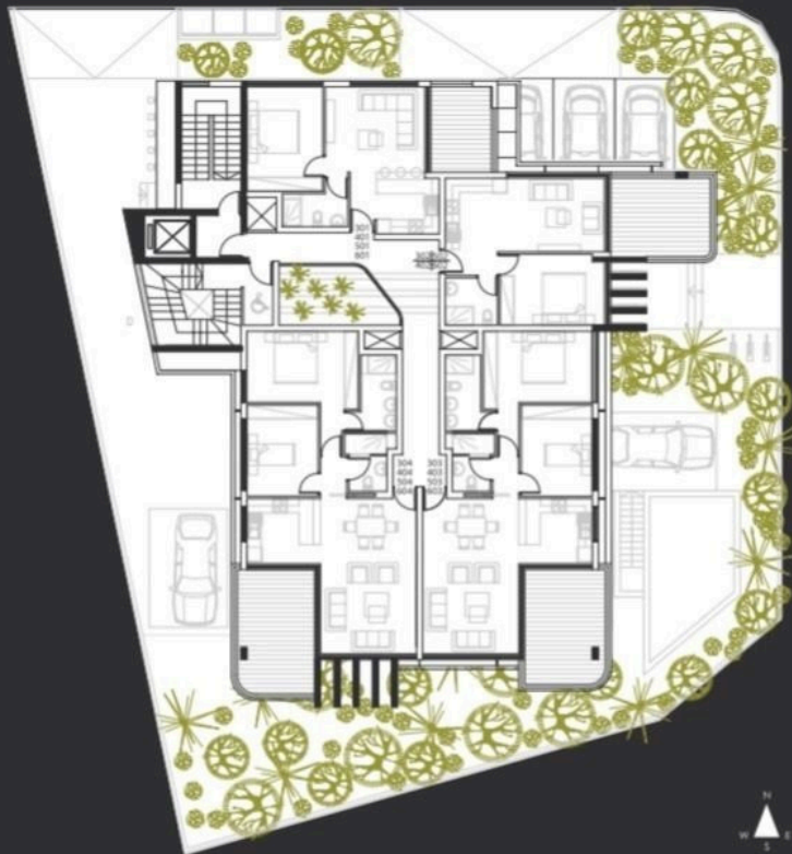
3 RD - 6 TH FLOOR