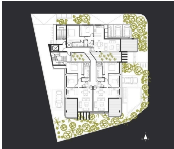
1 st - 2 nd FLOOR