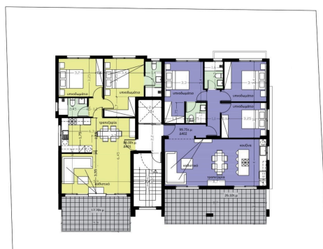
KATOPI 40Y. OPOBOY