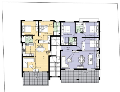
KATOPI 20Y OPOBOY