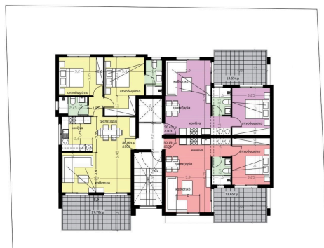
KATOPI 1ΟΥ ΟΡΟΦΟΥ